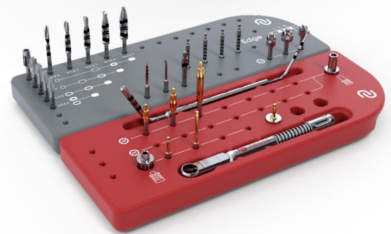
Depth Gauge Probe